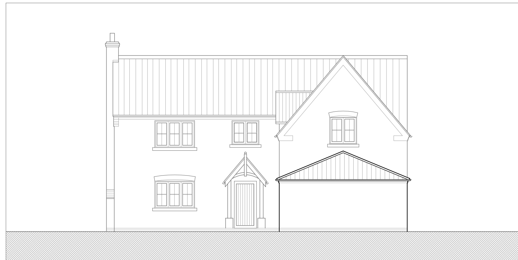
Proposed North East Elevation 1:100