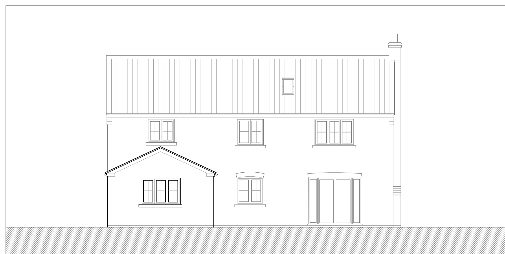
Proposed South West Elevation 1:100