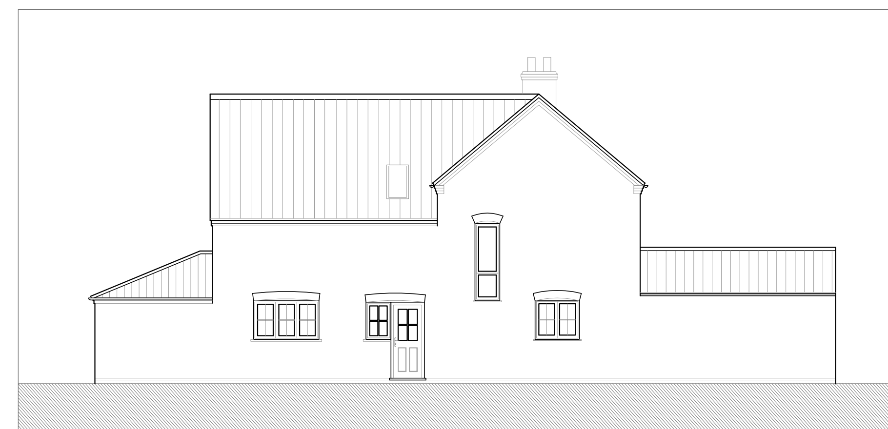
Proposed North East Elevation 1:100