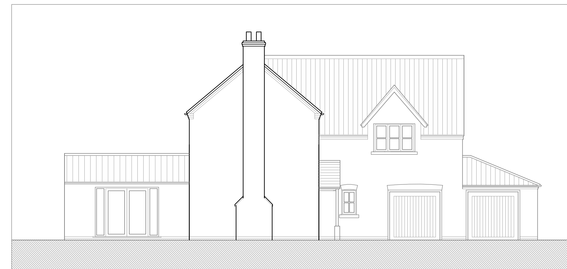
Proposed South East Elevation 1:100