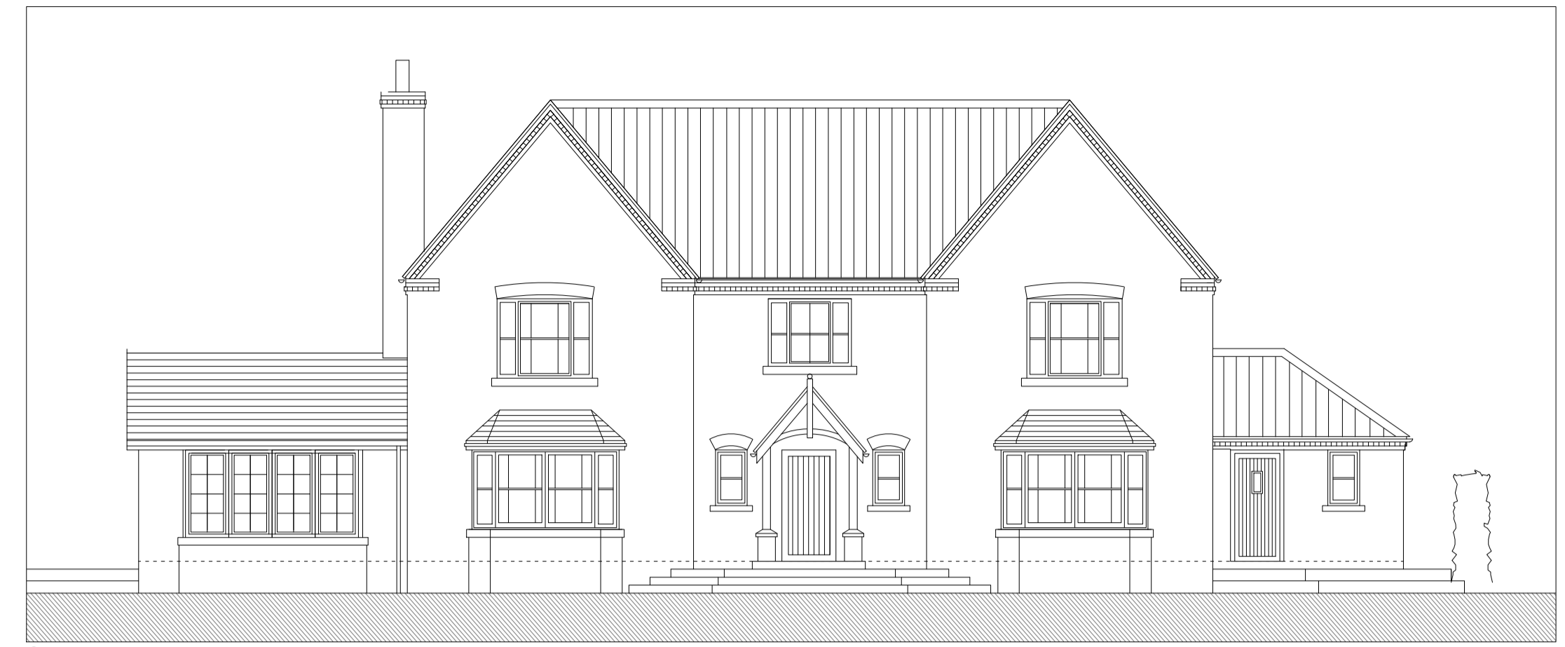
South Elevation 1:100