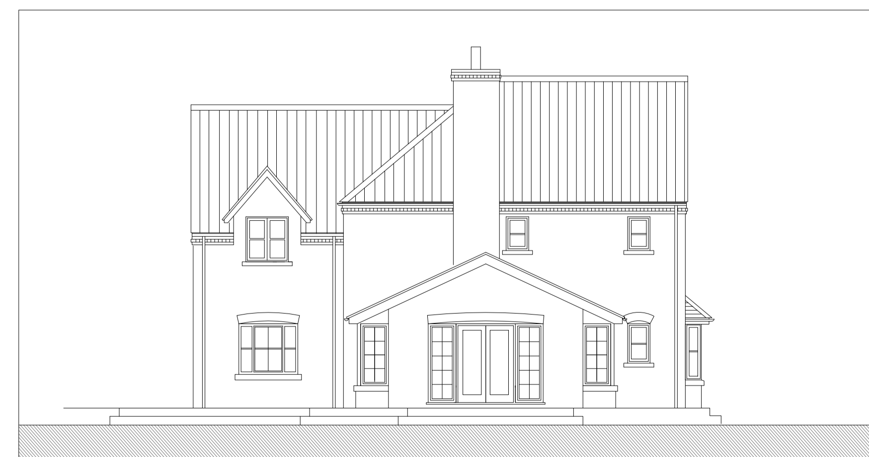
West Elevation 1:100