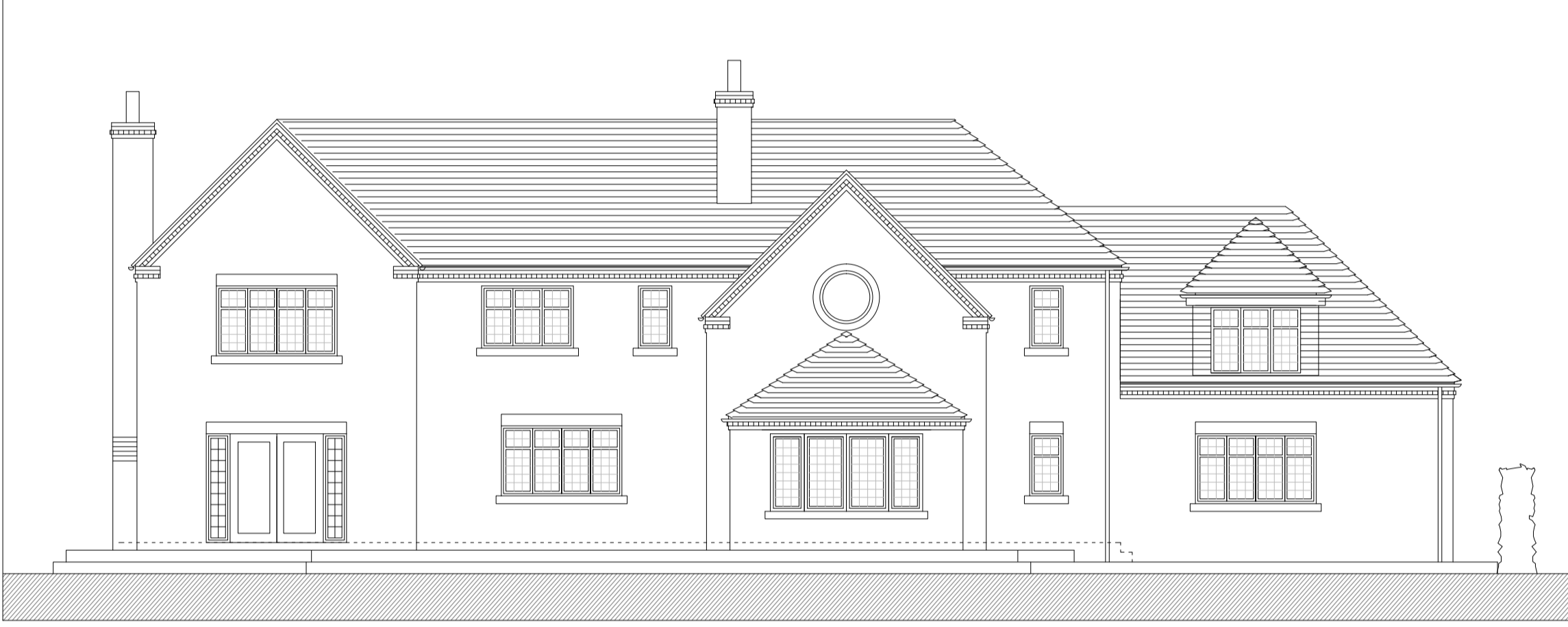
North-East Elevation 1:100