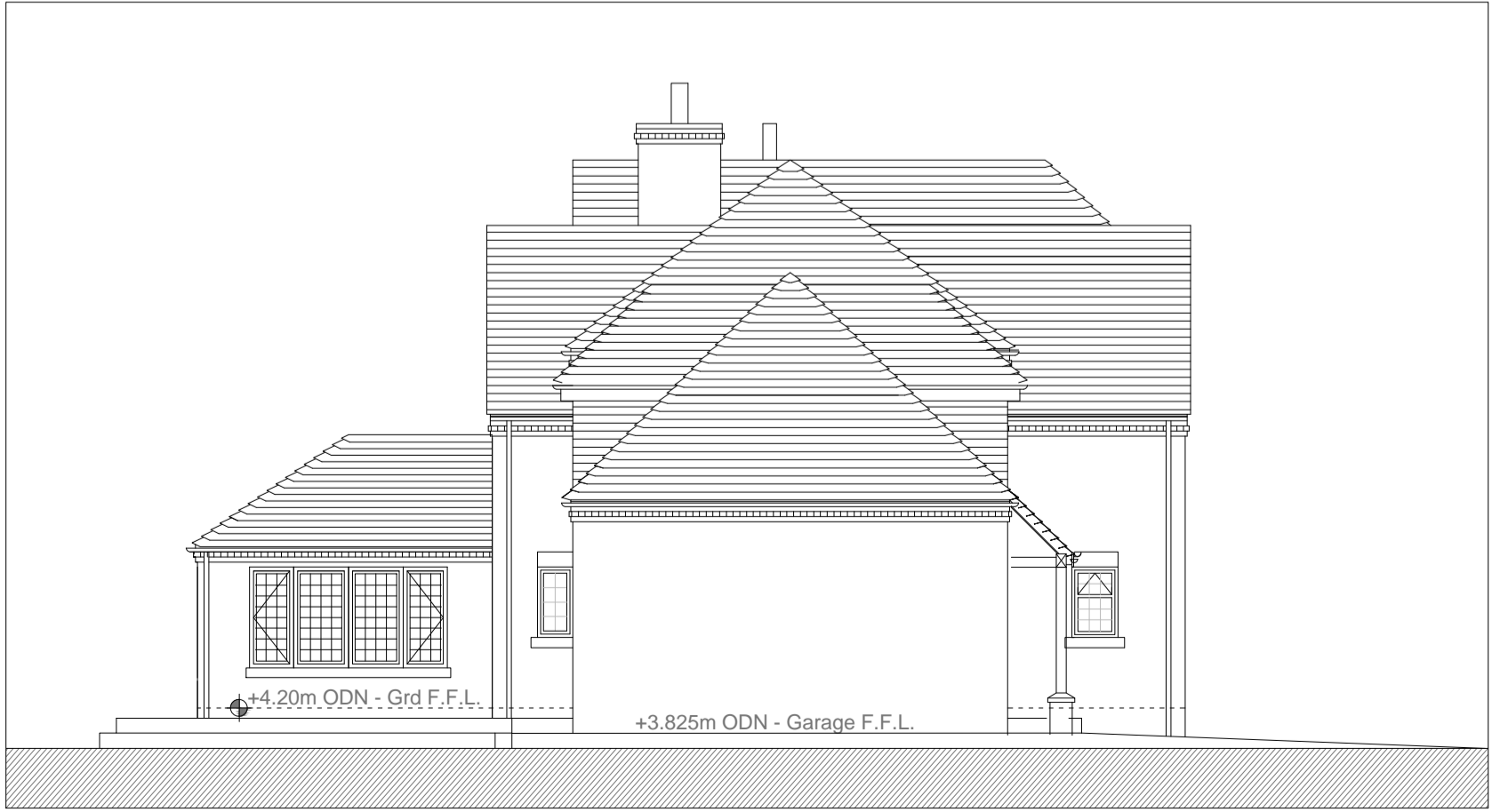
North-West Elevation 1:100