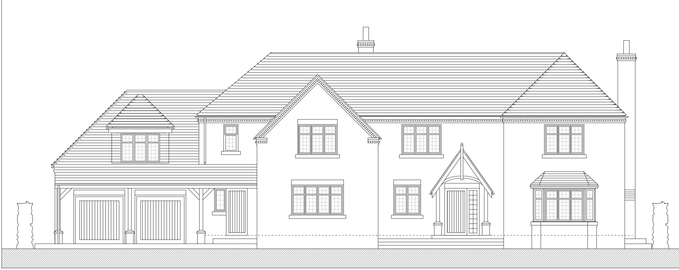
South-West Elevation 1:100