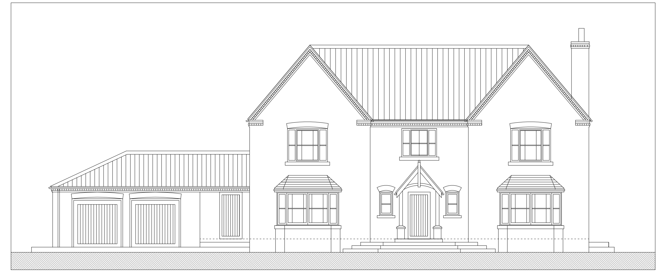
South-West Elevation 1:100