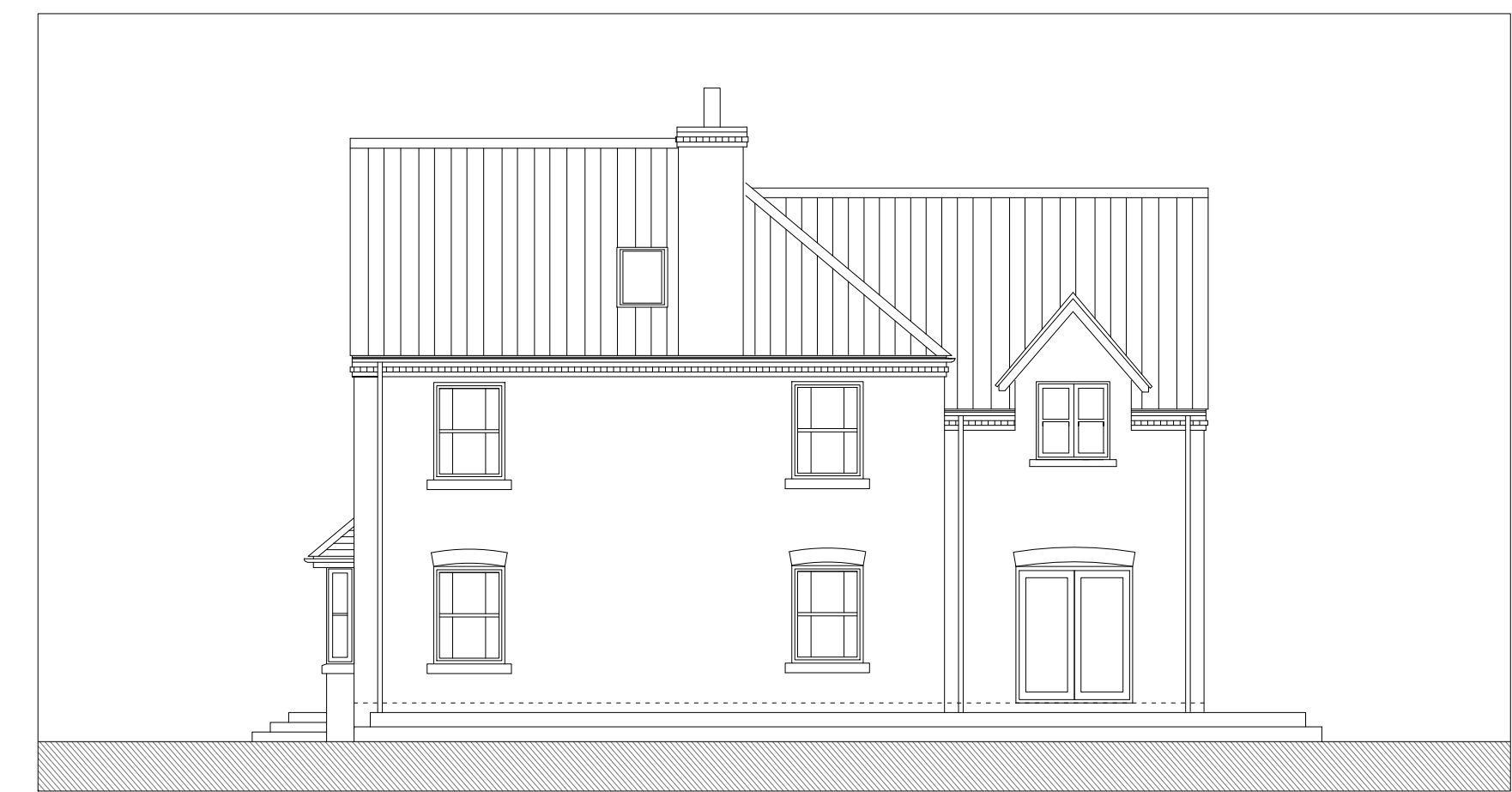
South-East Elevation 1:100