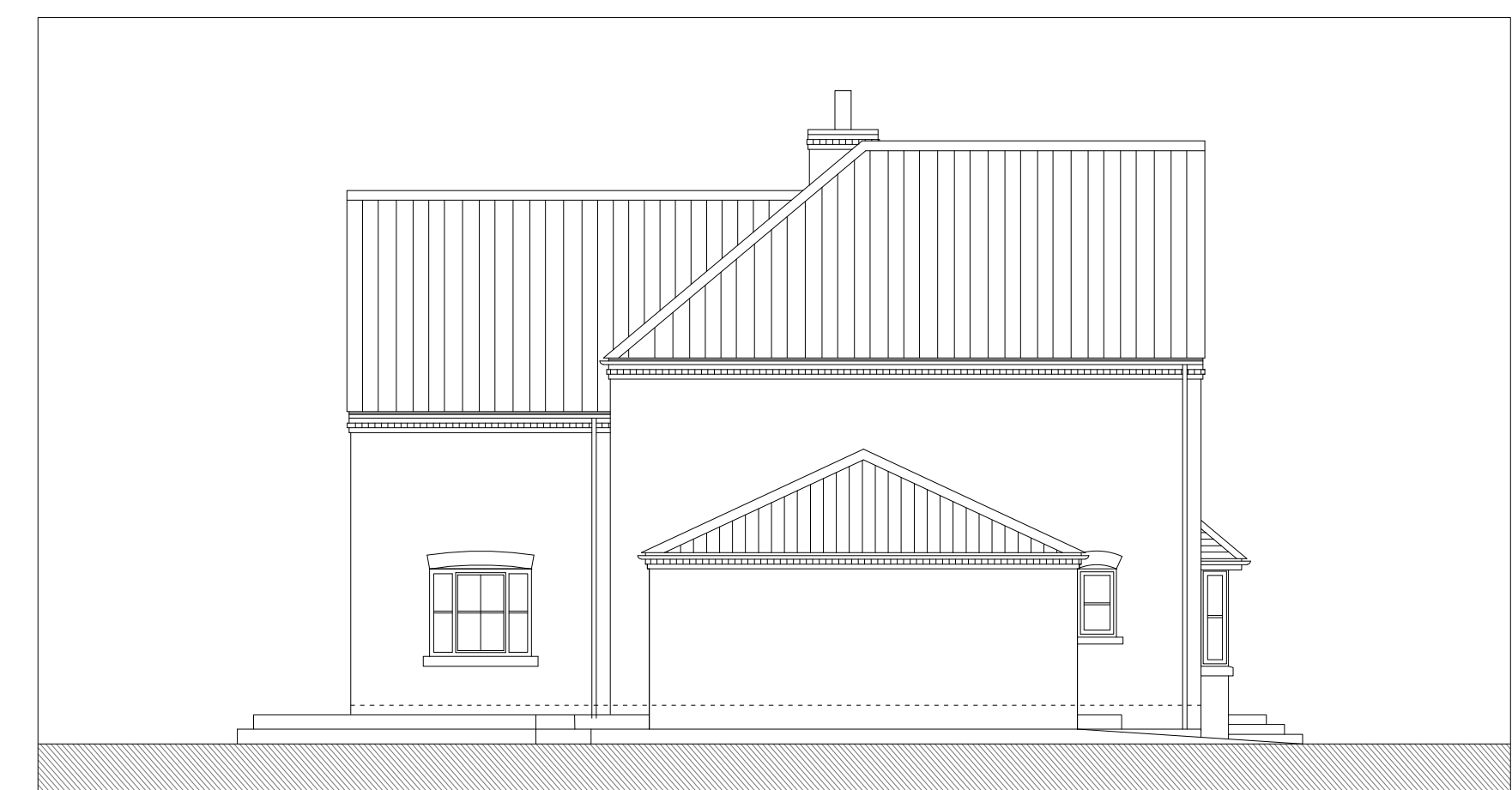
North-West Elevation 1:100