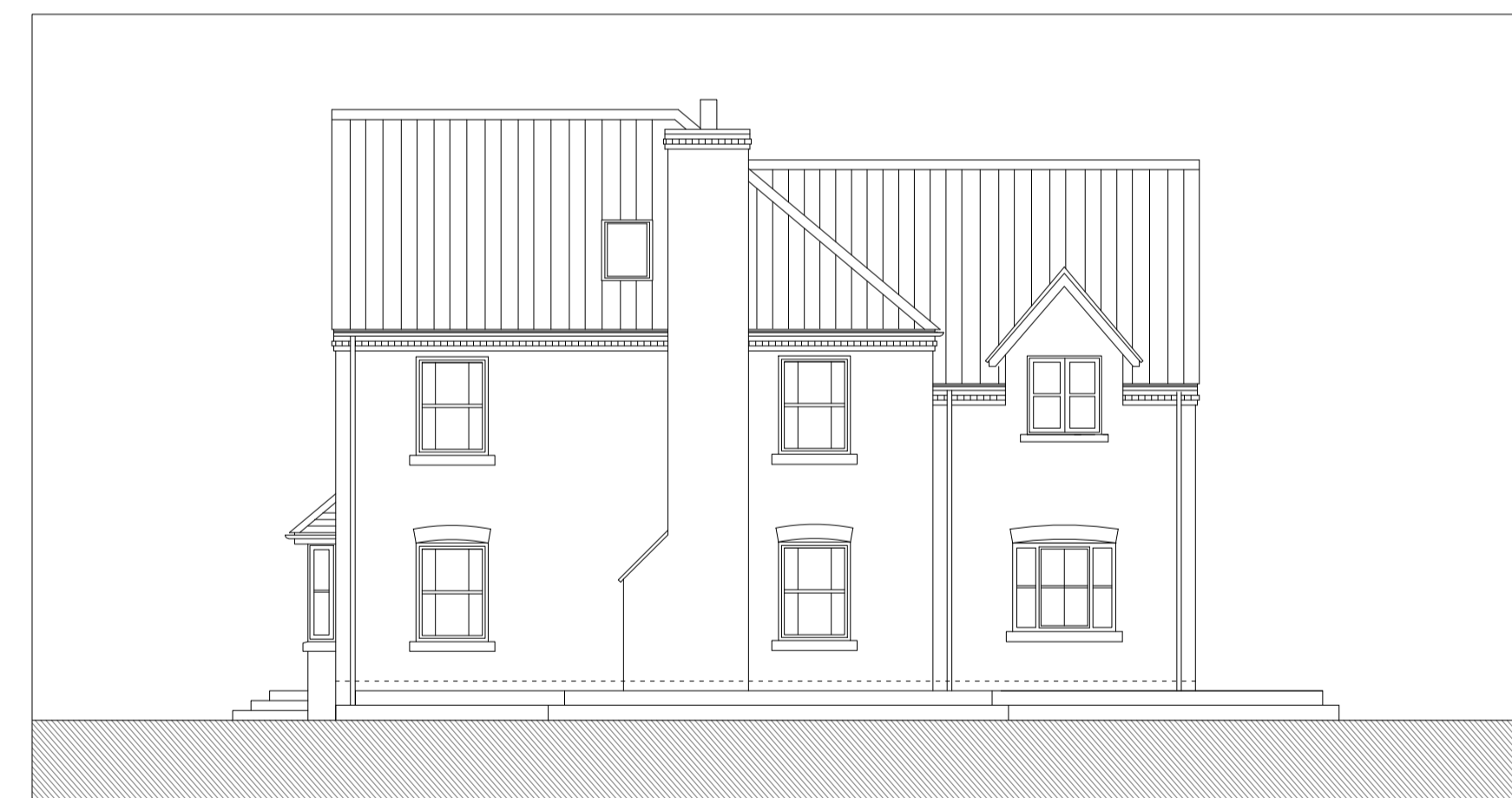
North-East Elevation 1:100