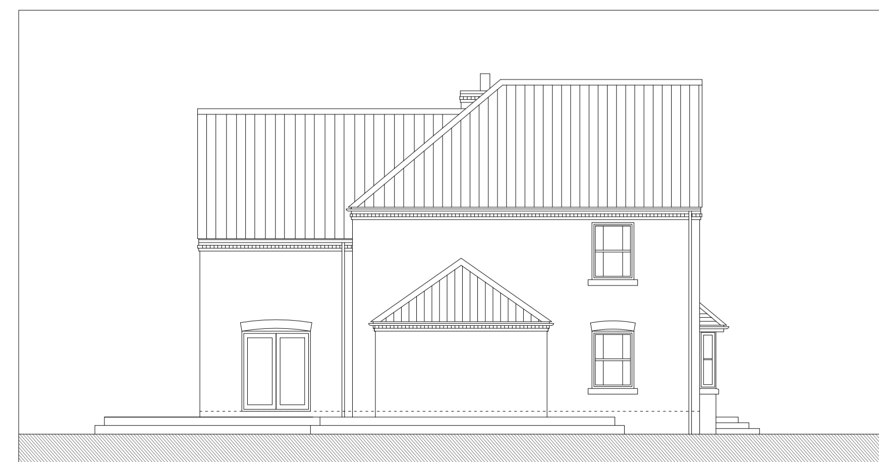
South-West Elevation 1:100