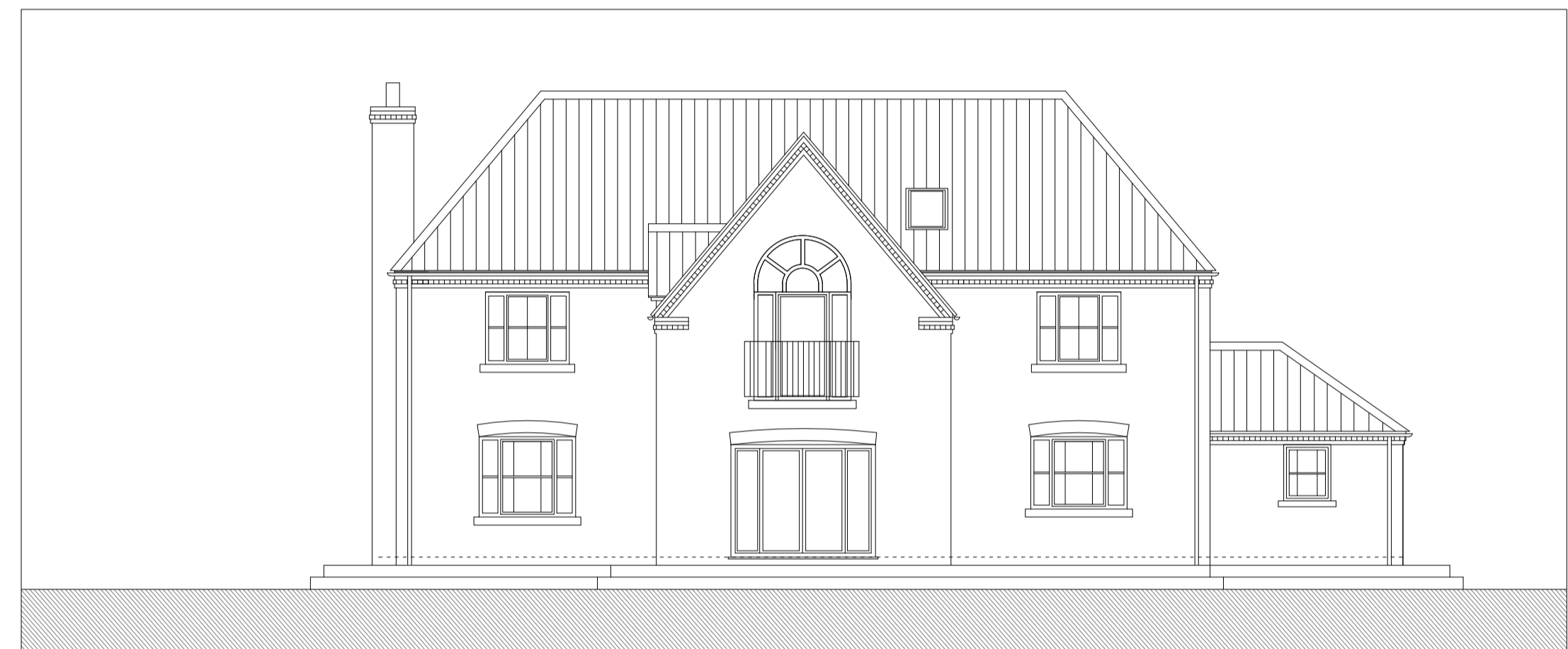
North-West Elevation 1:100