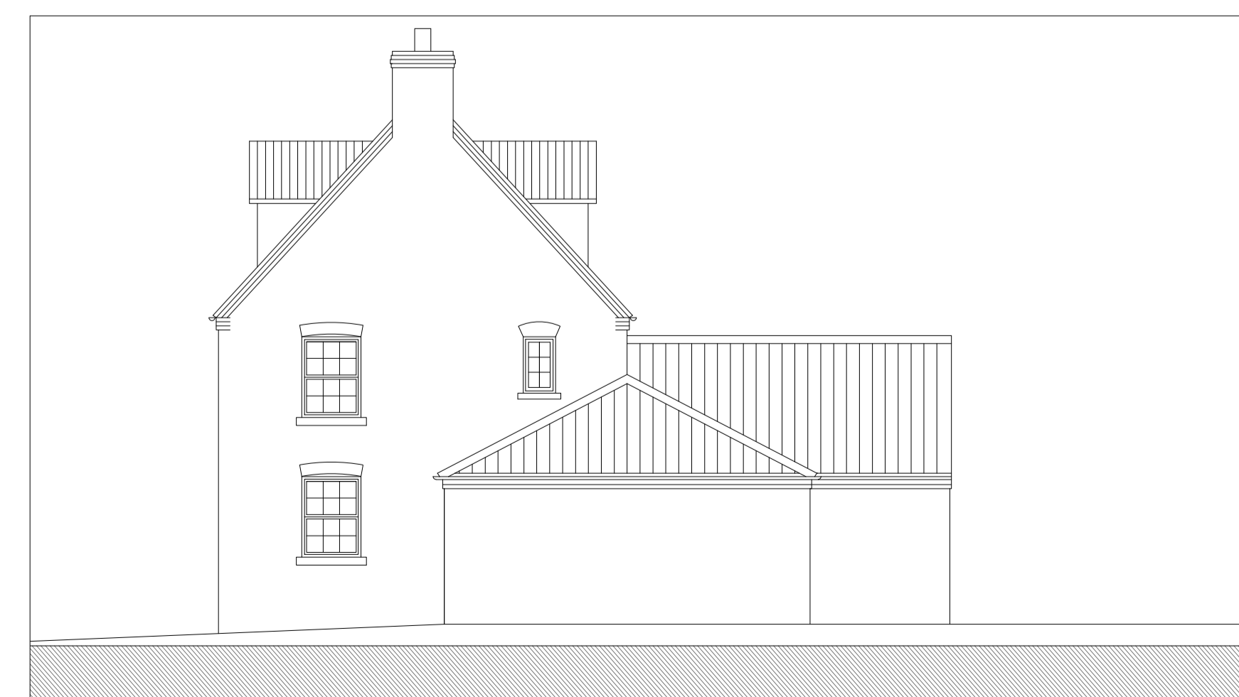
North-West Elevation 1:100