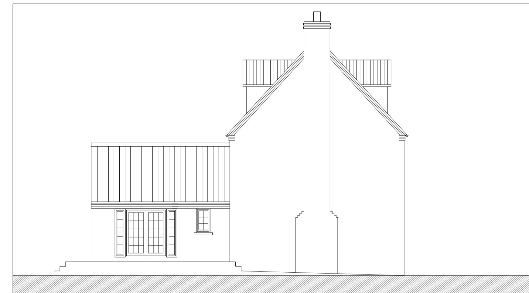
South-East Elevation 1:100