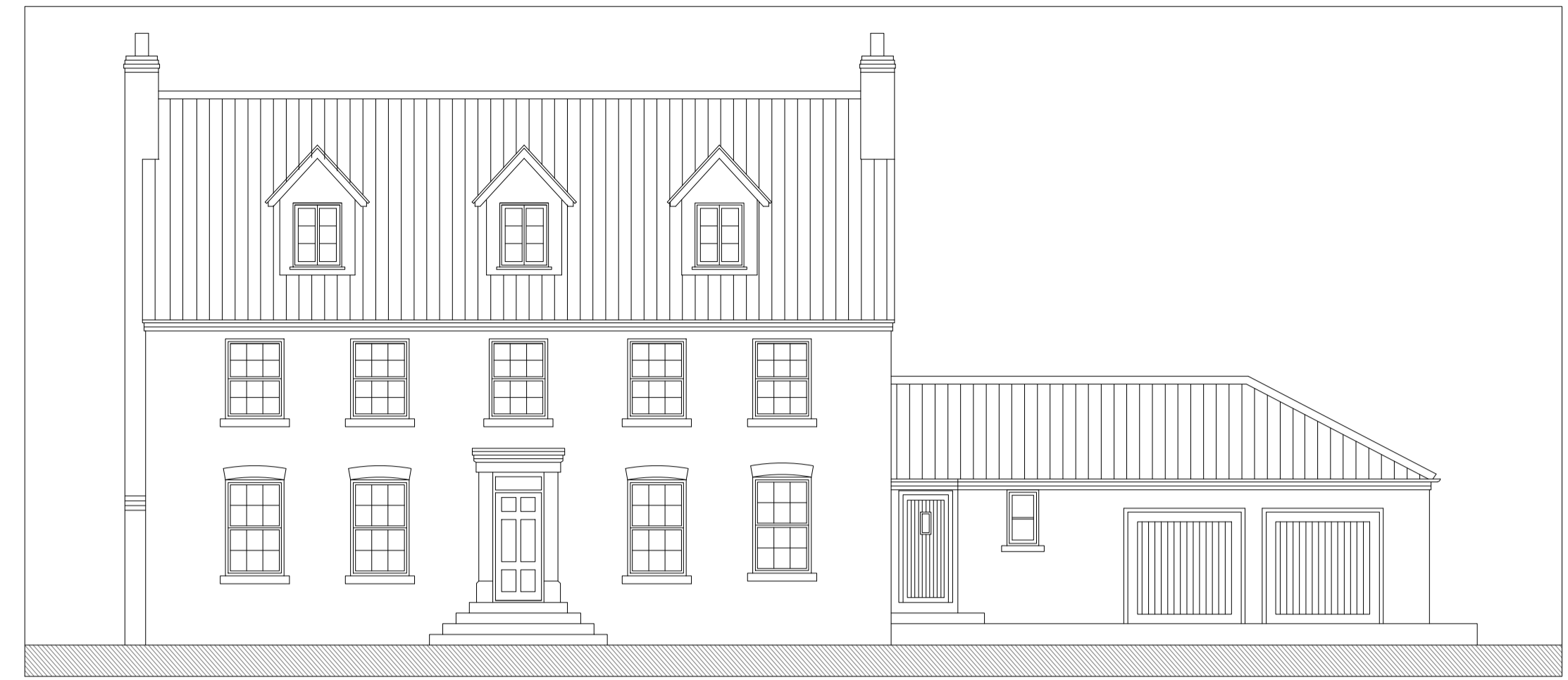
North-East Elevation 1:100