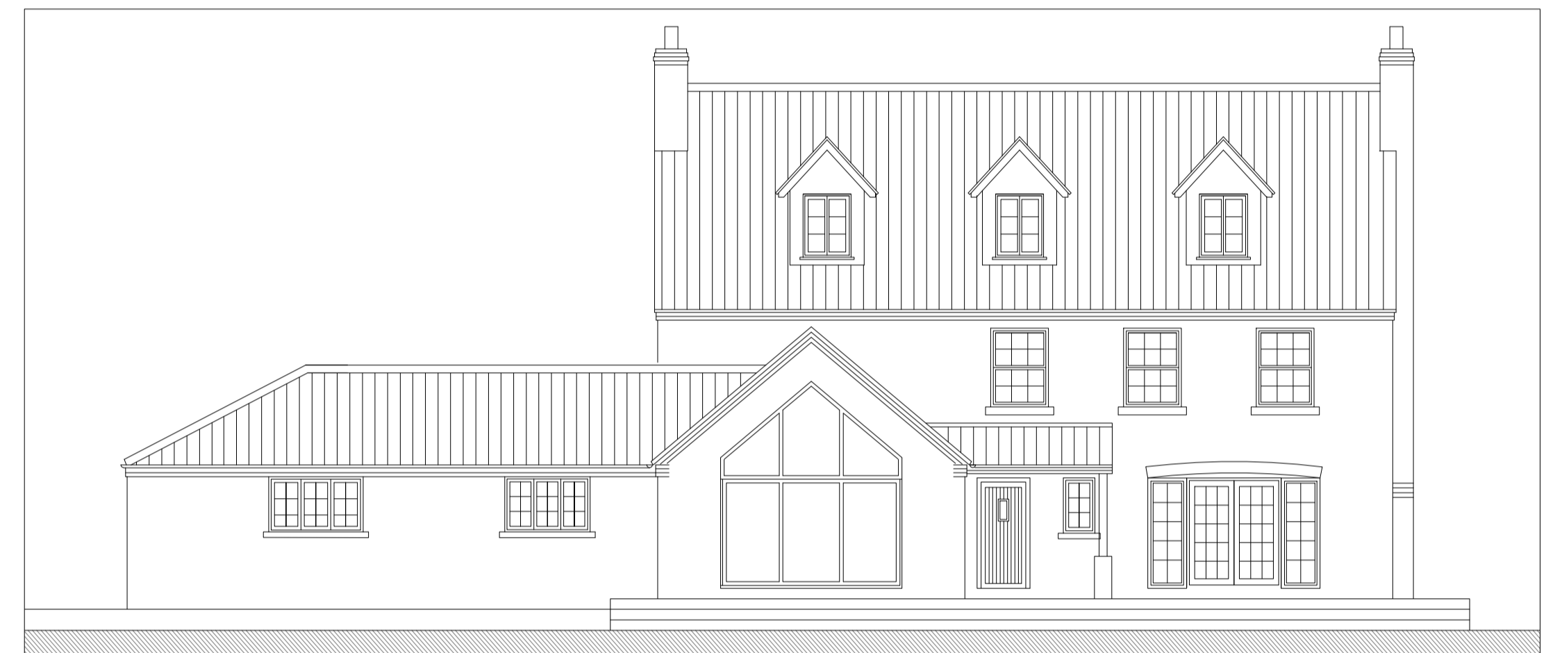
South-West Elevation 1:100