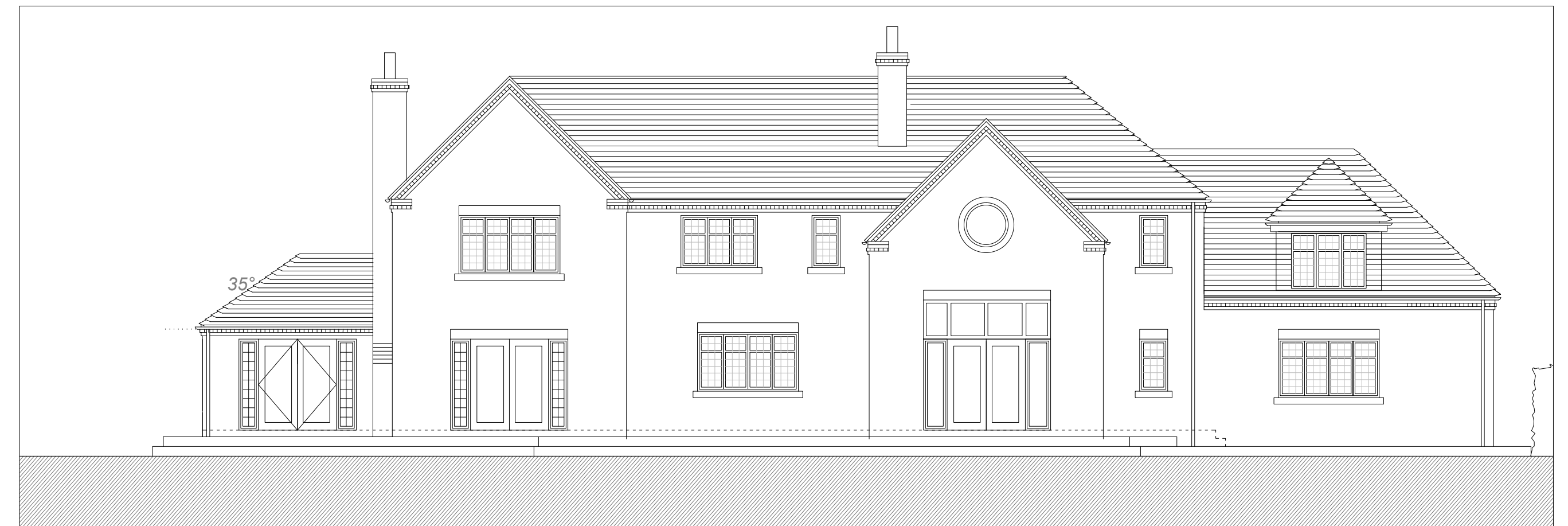
South-West Elevation 1:100