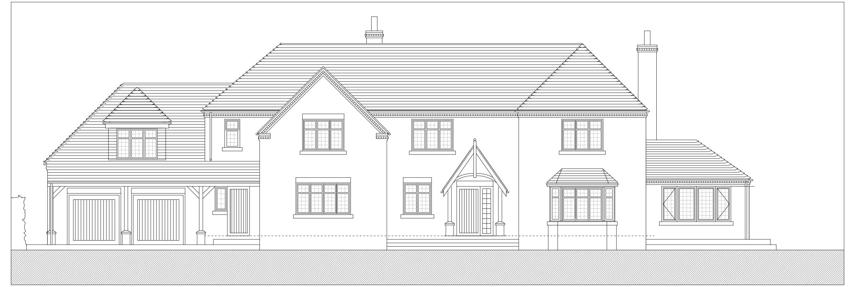
North-East Elevation 1:100