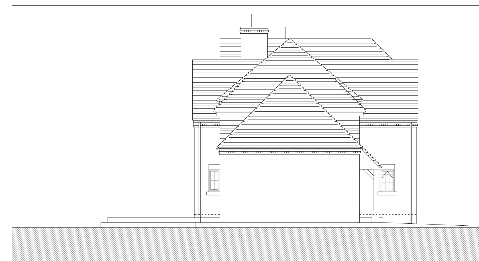
South-East Elevation 1:100