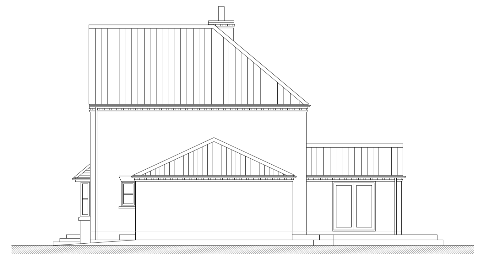
1:100 @ A1