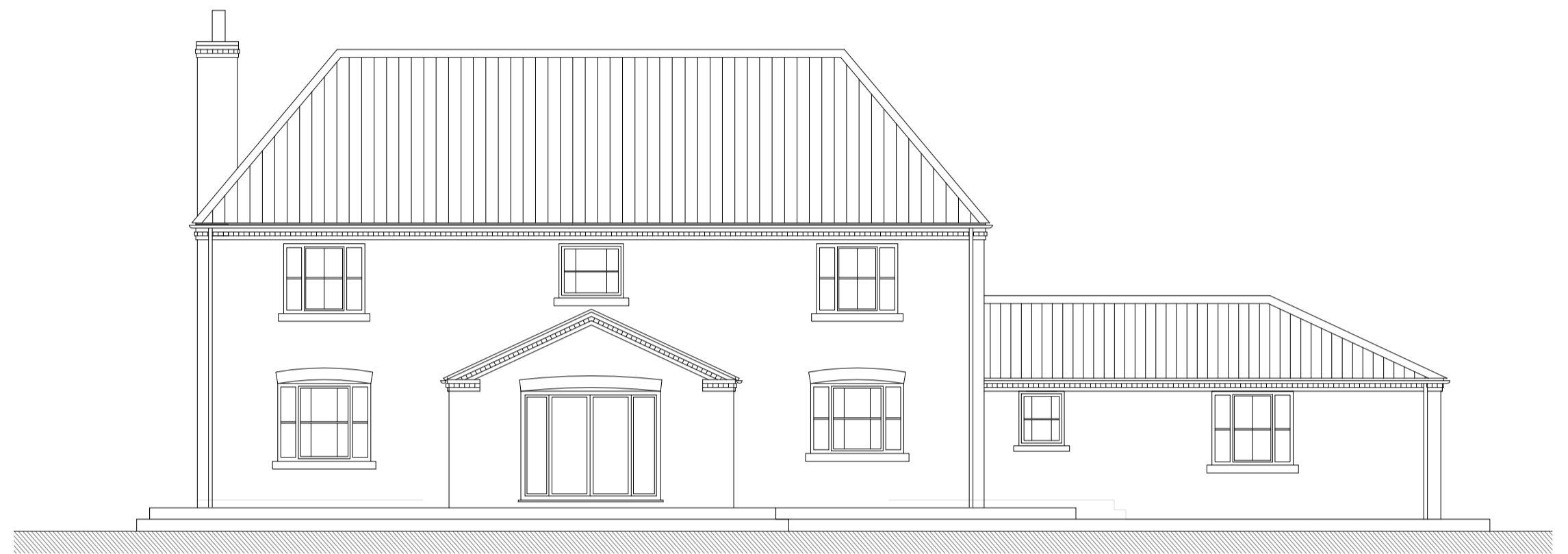
1:100 @ A1