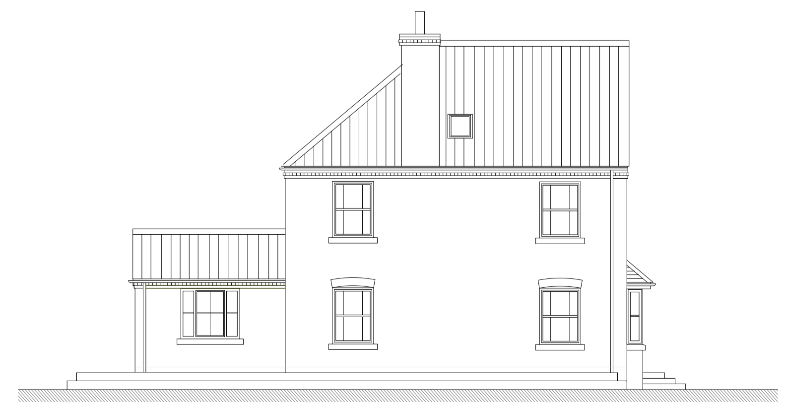
1:100 @ A1