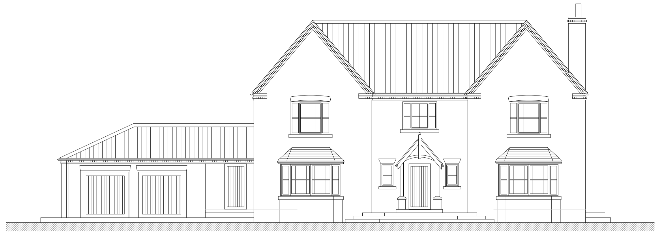
1:100 @ A1