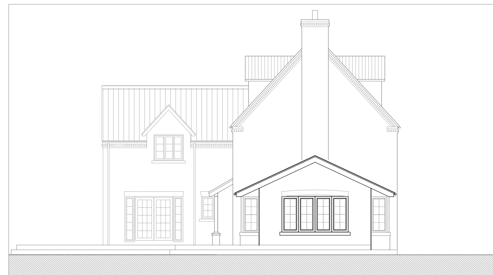
South-West Elevation 1:100