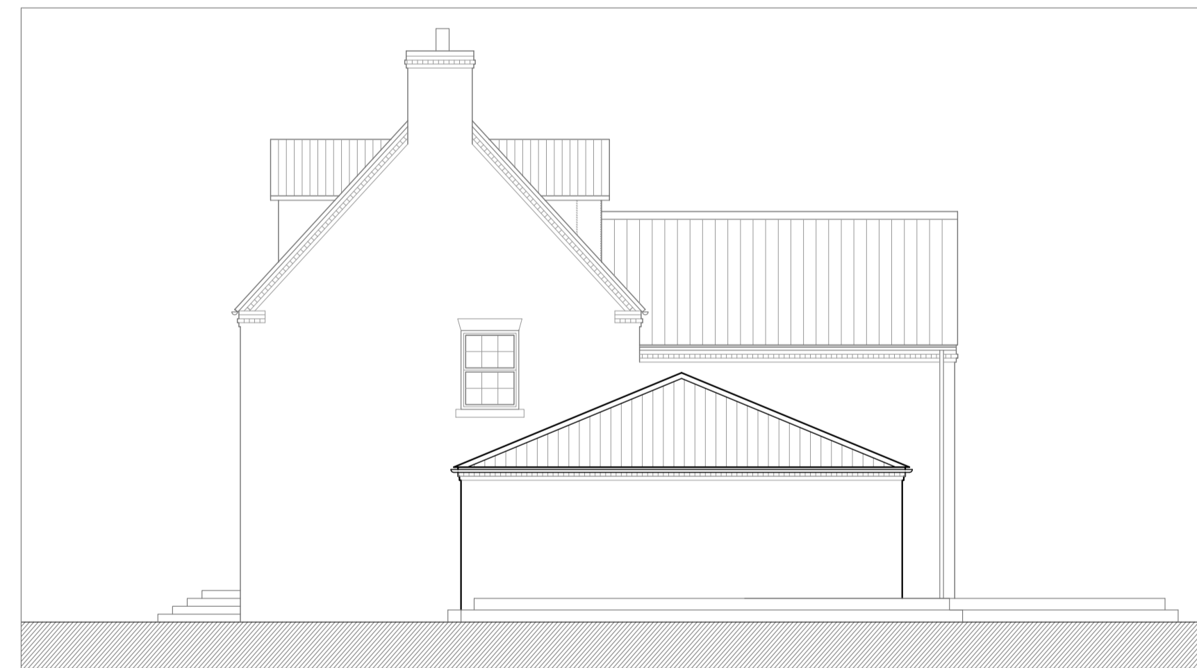
North-East Elevation 1:100