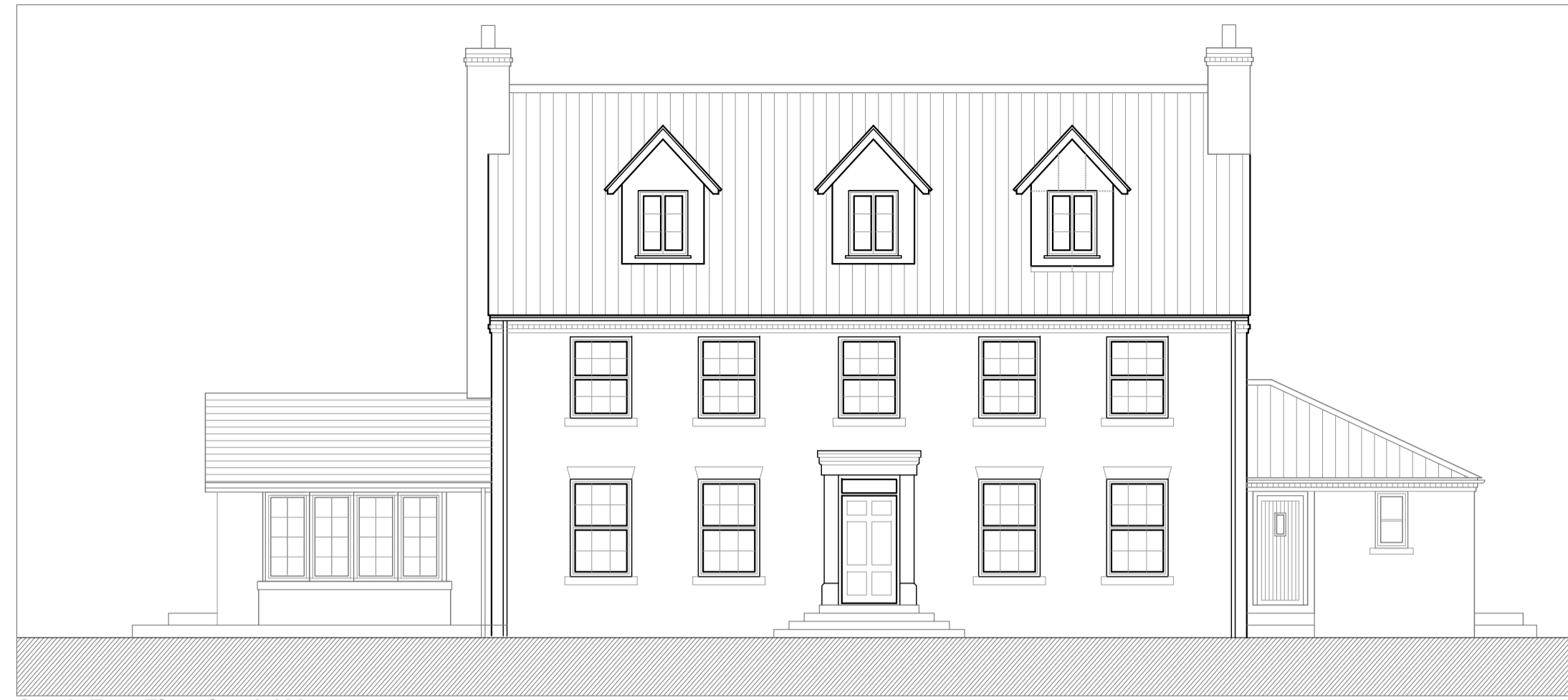
South-East Elevation 1:100