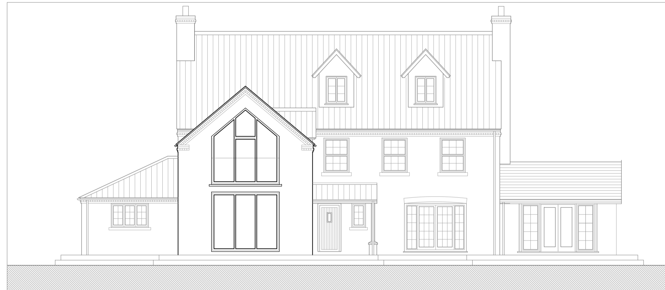
North-West Elevation 1:100